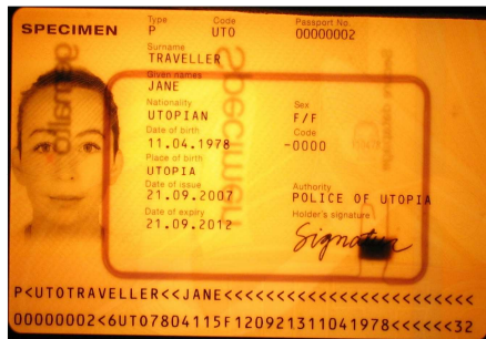
Fig. 1. Chip and antenna integrated in the polycarbonate data page.

The chip and the antenna are integrated into the cover of the booklet or another page of the passport. The chip and antenna are typically not directly visible and can be only seen using a strong light (see Figure 1). An exception is the UK passport where the chip and antenna is laminated in one of the pages and can be directly seen (see Figure 2). An electronic passport can be easily recognized by the logo on the front page. The communication is contactless and complies with the ISO 14443 standard (both variants – A and B – are allowed). Technology based on ISO 14443 is designed to communicate over a distance of 0-10 cm and supports also relatively complex cryptographic chips and permanent memory of kilobytes or megabytes. Higher communication layer is based on the classical smart card protocol ISO 7816-4 (i.e., commands like SELECT AID, SELECT FILE and READ BINARY are used).