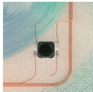
Fig. 2. Chip and antenna in UK passports.

The data in electronic passports are stored as elementary files in a single folder (dedicated file). Up to 16 data files named as DG1 to DG16 (DG for Data Group) can hold the data. See Table 1 for the overview of the content of the data groups.