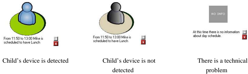
Fig. 1. Graphical presentation of awareness information

In our prototype, parents could view three possible images. These are shown in Figure 1. By moving the mouse over the image parents would see more detailed information about when was the last check by the PC in the classroom performed. It was developed to be always on top of other windows. Using two buttons parents could minimize or close it.