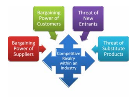
Figure 1. Porter's Five Forces Model 11

In this sub-section, we apply the Five Forces Model to an online social networking site, Ning.com , as an illustration of how the model may be used in analyzing