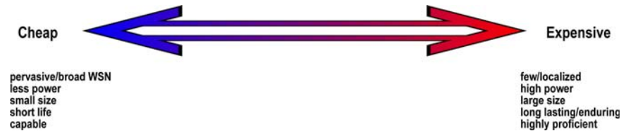
Fig. 1. The cost spectrum for SN systems

points vertically between the surface and the bottom of the water body. This makes the cost of the sensors extremely important in order to take the most measurements.