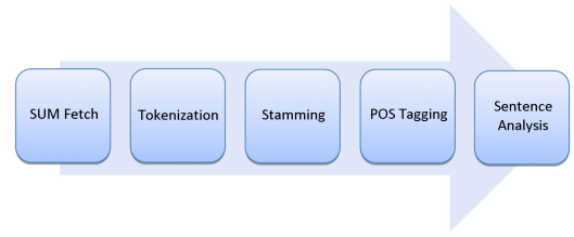
Fig. 3. Text Mining stages applied to an SUM.

The first step of the text mining process is the fetch of the SUM. Then, before performing any operation, the SUM is tokenized. This is a fundamental step that converts each stream of characters into a stream of processing units called tokens. Each token is then converted to a standard form by the process of stemming, that reduces different grammatical word forms