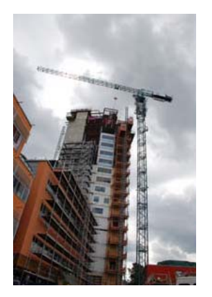
Fig. 1. Tornet (The Tower) during construction

The products which will be included in this study are plasterboards, doors and kitchens. The reasons why these particular products have been chosen are the following: plasterboards are chosen because of the common use of this product in the construction industry. Doors and kitchens are also chosen based on their commonality. Also, they have been subjected to delivery disturbances and quality problems for the examined construction site.