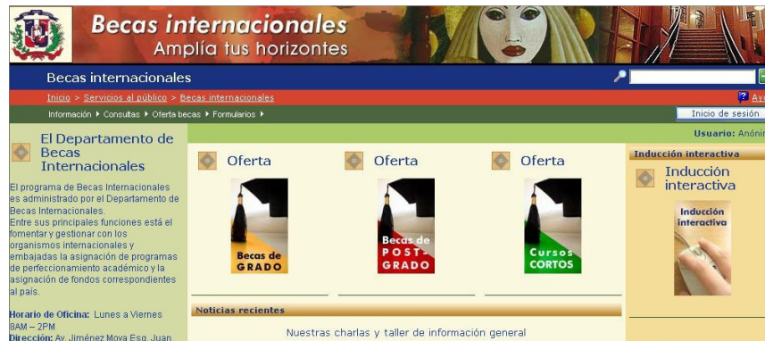
Figure 3 – Screenshot of International Scholarships VLC.

available options and community members search for those options effectively. Additionally, the community serves as a training site for prospective scholarship recipients, and as a Service Center for real-time communication between students and professors and the people knowledgeable about scholarships.