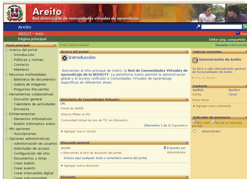
Figure 2 – Screenshot of Areito Virtual Learning Communities Portal.

The Areito VLC directory (central position on screen) contains entries with URLs to actual VLCs hosted for different universities and educational organizations in the Dominican Republic. Examples of current VLCs in this directory include specific communities on the following subjects: ICT Use in Education; Agro-alimentary, Biotechnology and Business Sciences; National Defense Academy; Websites Visibility; English Teaching; Education on AIDS Issues; and Presidential Forum for Educational Excellence; among others. All these VLCs have been developed based on templates and make intensive use of collaboration tools such as digital bulletin, event organization and digital market, described earlier in this paper. It is expected that with adequate training and support, end-users will be able to actively create and cultivate many other VLCs themselves.