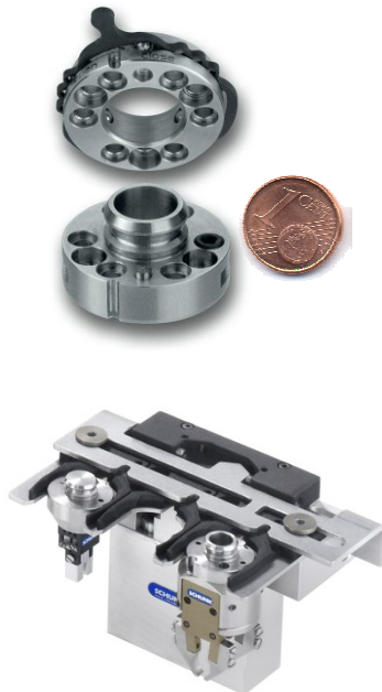
Figure 5: Micro Tool Change System MWS and Storage Rack MWM