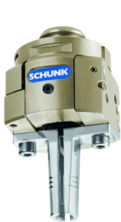
Figure 4: End effector: Parallel Micro Gripper MWPG