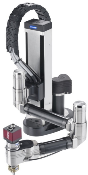
Figure 6: Miniature Modular Arm MGA.