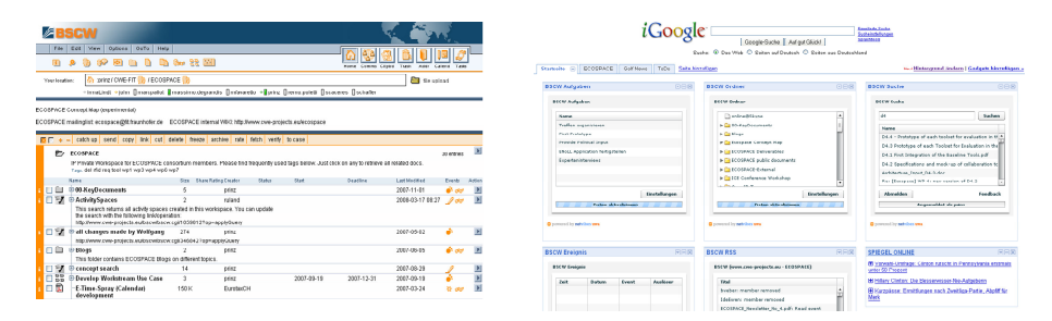
Fig. 2: Comparison of a monolithic user interface and a widget based collaboration portal.

Applying a reference architecture [12], including the definition of basic cooperation services, we can open the door towards an individually configurable cooperation solution. This is achieved by realizing a set of interaction widgets to support basic collaboration services. It means that users can configure their cooperation environment by the selection of those collaboration services that are most appropriate for their specific tasks. This motivation has lead to the development of a set of CWE widgets that correspond to basic collaboration functions.