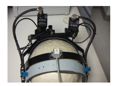
Fig. 5. Magnetic sensor attached to the ASL eye tracker's helmet

dynamic link libraries (dll). External data can also be injected using socket communication. For head tracking we have used an external connection to a dynamic library written in c++ which retrieves the position and orientation of the head from a magnetic tracker. Data from the eye tracking device was transferred through an UDP port.