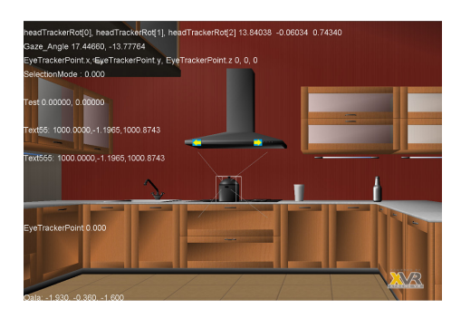
Fig. 4. The frames of the gaze direction bounding box

with the green square. The system can detect when the user is gazing at the green square by testing the collision between the gaze direction bounding box and the green square. In Fig. 4., the frame of the bounding box is displayed and it can be noticed that it intersects one of the objects in the virtual environment, a pot. In this case the bounding box of the selected object is also drawn to confirm the success of the selection procedure.