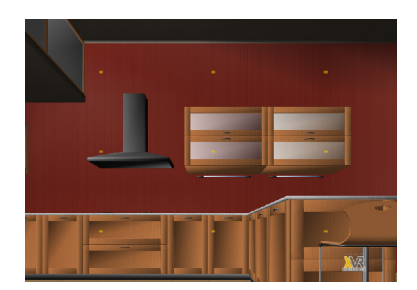
Fig. 2. Calibration points displayed on the powerwall

Our experiments have been conducted on a large projection screen, normally used for visualization of stereoscopic scenes. The nine calibration points were displayed in a similar fashion as on the small desktop screen Fig 2., with respect to the visual field