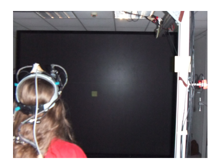
Fig. 3. The green square displayed on the powerwall

The scenario of the tests was very simple; the users had to perform as many selections as possible within 90 seconds. Gaze direction is represented by a bounding box, starting from user's head towards the screen, long and thick enough to collide