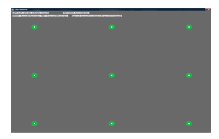
Fig. 1. Calibration screen for a desktop PC

Calibration of the eye tracker used in our experiments, ASL H6-HS-BN 6000 Eye-Track model, an accurate and high speed head mounted system, is typically made on a normal desktop screen Fig. 1., by sequentially gazing at each one of the green points.