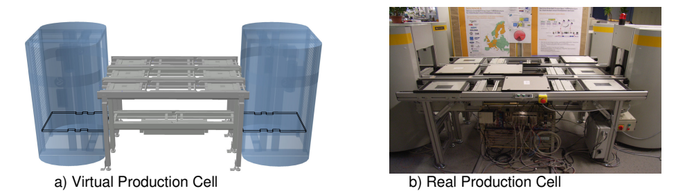
Fig. 1. Virtual and real representations of a SoA-based production cell.

Since all participants in the production line share the same network and high-level functionality, and the components in both the virtual and the real environments appear in the network as autonomous devices, there is no difference in functionality between them from the controller's point of view, which allows replacing some of the virtual components for real ones for testing purposes. The outcome is an open architecture where all the participants can communicate freely according to their function, as seen in Fig. 2.