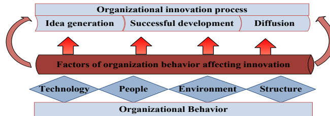
Fig.2. organizational behavior in supporting innovation

be commercialized. The innovation is diffused internally and/or externally for wider use of customers in order for the organization to be able to gain the benefits and reap the profit.