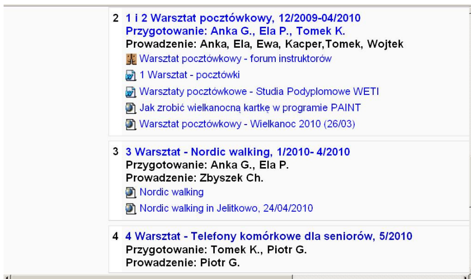
Fig. 2. Example e-workshops offered in LLLab project

Up till now PRO-MED sp. z o.o. delivered the following workshops: