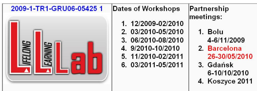
Fig. 3. Example information about LLLab project located in Moodle

The idea of establishing the online e-senior Magazine was born in 2008 during the EDEN Conference in Lisbon. The most interesting projects' events and achievements are documented there as essays [10].