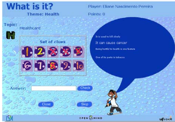
Fig. 1. Player's Module

The game bears these issues by supporting teachers to work on themes related to the transversal themes [4], allowing teachers to have a picture of the language, beliefs and habits from a certain group considering these themes. The “What is it?” framework is divided in two modules explains in section 2 and 3, and in section 3 describes a future works and conclusion.