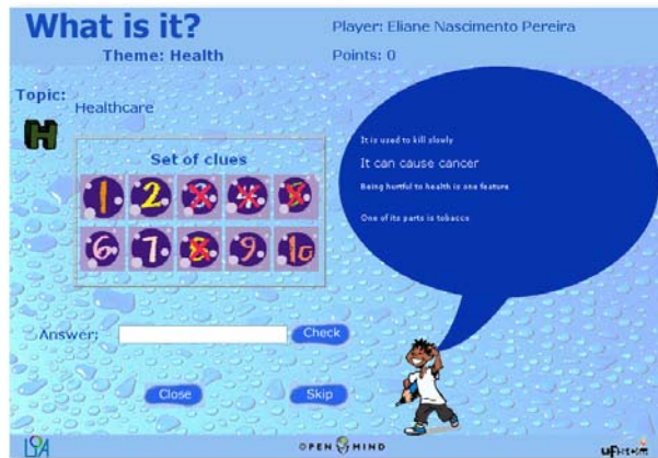
Fig. 1. Player's Module

The game bears these issues by supporting teachers to work on themes related to the transversal themes [4], allowing teachers to have a picture of the language, beliefs and habits from a certain group considering these themes. The “What is it?” framework is divided into two modules explained in section 2 and 3, and in section 3 describes a future work and conclusion.