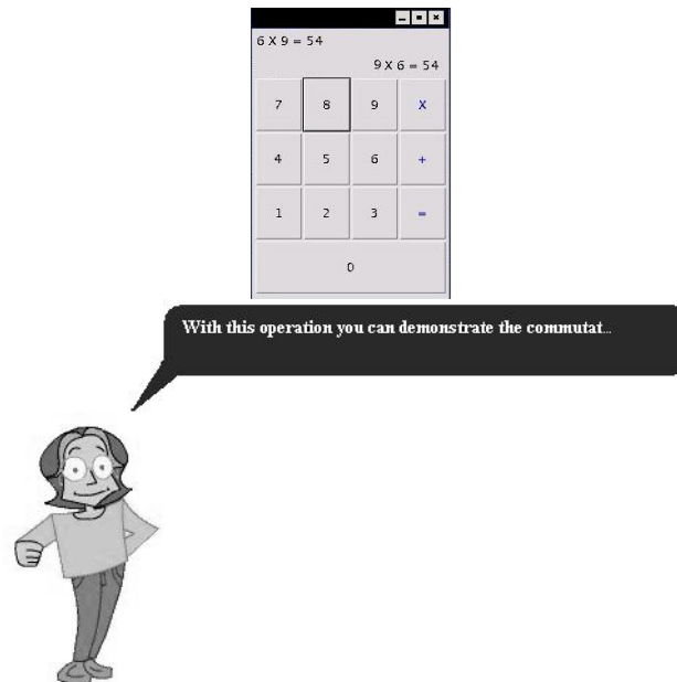
Figure 2. The APA giving an instruction.

(see Figure 2) playing the role of an animated tutor to help primary school students to learn some fundamental mathematical properties of multiplication.