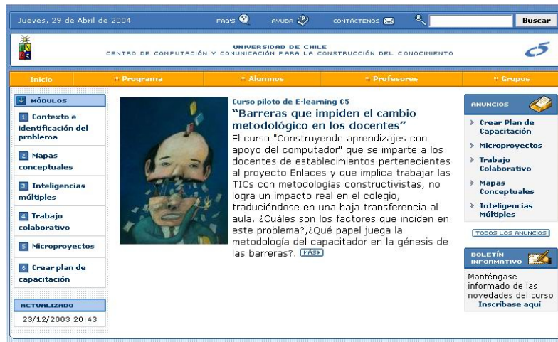
Figure 3. The main navigation screen of the e-Learning course

To illustrate the feasibility of the model we describe the implementation of a course on methodologies for using technology for teachers (see Figure 3). Thirty-five experienced teachers took the online course. We divided the course into eight working units with the corresponding learning activity and questions to enrich interaction among learners participating within the virtual dialog classroom. Each unit was covered in one week and ended with a synthesis of conversations, analysis, discussions, and exchanges.