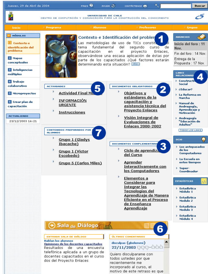
Figure 4. Unit sections of the e-Learning course

Each unit was based on seven sections: 1. Unit description, 2. Mandatory documents, 3. Complementary documents, 4. Related links, 5. Activities, 6. Virtual dialog classroom, and 7. The learner’s synthesis (see Figure 4 ).