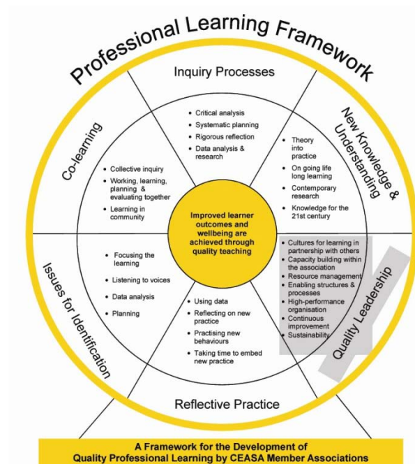
Fig 3. Framework of Professional Learning