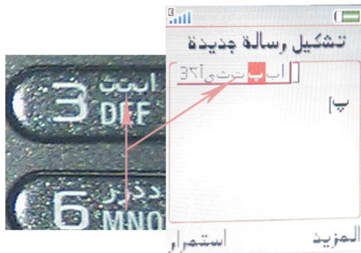
Figure 3. Discrepancy between illustrated and actual number of key press

In general, ligatures and diacritical marks are found by pushing the corresponding letter (often several times), but where the most often used, like لا [lam-alef] would be part of computer keyboards, it is here found by writing these two letters after each other, and then the combination is automatically made. However, as the keypads do not show this, this has to be experimentally found (on trial-error basis). There are of course, as is also the case in Danish and English, many other special characters to choose from, with needs as much as 9 clicks before they appear on screen. Though they are rarely used, and for the most users perhaps newer used, the “interesting” part is to find them, as they are not illustrated on the pads, and they are not always placed at the same place in the phones, similar to Hindi and Devanagari writing discussed earlier.