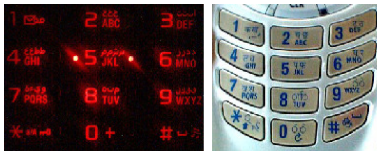
Figure 2. Arabic and Devanagari keypad layouts

These heuristics were applied for Danish, Hindi and Arabic mobile phones, whereas we have referred the existing research on Chinese.