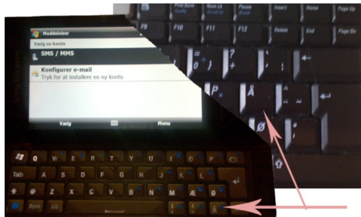
Figure 4. Discrepancy between smart phone and PC QWERTY keyboards

When it comes to the use of smart phones, they often include either a stylus or virtual keyboard in qwerty-style for entering letters, or even in the most modern versions a physical keyboard. In the Xperia version it is however interesting to see how the placement of å is different from the typical Danish qwerty keyboard style (figure 4). For users who are used to writing without looking at keys at a regular qwerty-keyboard, this results in poor speed and disruption of flow in writing (which is especially interesting when investigating interaction with phones for writing mails for work).