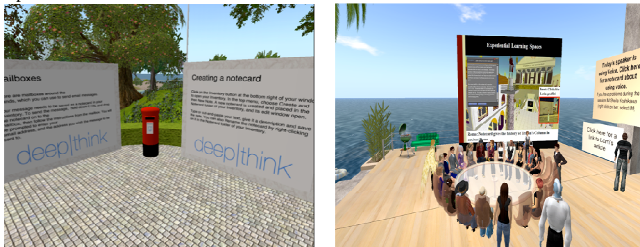
Figure 1. (a) A drop box to collect feedback; (b) A round-table discussion

An educator discussed how the intended function should be integrated within the design: “I say one thing it needs to be very clear what the aim of the space is, ... that should not be because there is a nice sign saying what it is for but it should be in the character of the development. Something in the look and feel, the way you interact with the space is representative of its use so that it will make it easy for the user to understand” [Deep Think]. The objects in the learning spaces should imply the way in which the spaces can be used: “Well, I already mentioned chairs, although totally unnecessary [for the avatars] they do signal that a meeting is going on and certain people have committed to participating for a while” [SL educator and designer]. In Figure 1(b), chairs, a table, slide presenter, posters on the walls have been used to aid a presentation and follow-on discussions.