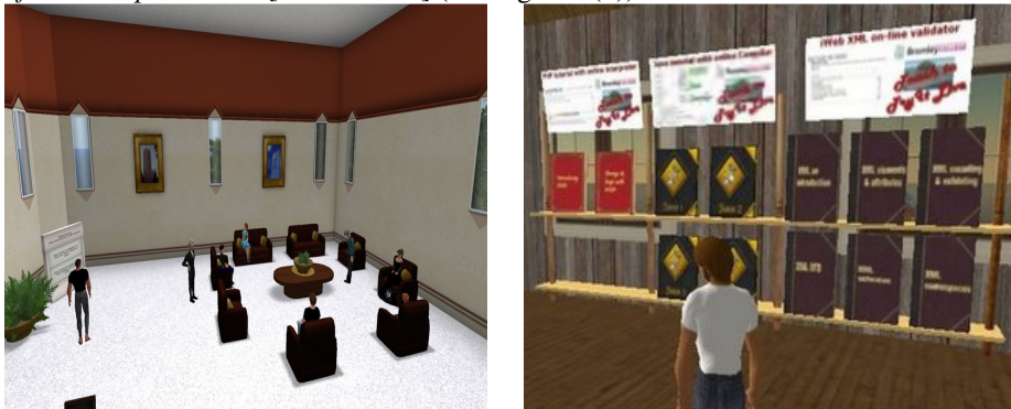
Figure 6: (a) Room without a normal exit; (b) Metaphors for conveying the function

Form should follow function: This principle implies that aesthetic considerations in design should be secondary to functional considerations. The participants mentioned that the design should reflect the learning activities: "... the design should be functionally and pedagogically appropriate, [and] integrated'... a design for a purpose". One educator gave a specific example: "... I actually used objects that looked like books, so the student would go up to a book and the book would open for them ..., so I tried to keep that form and function consistent with real-life and that sort of worked quite well" [SL educator] (see Figure 6(b)).