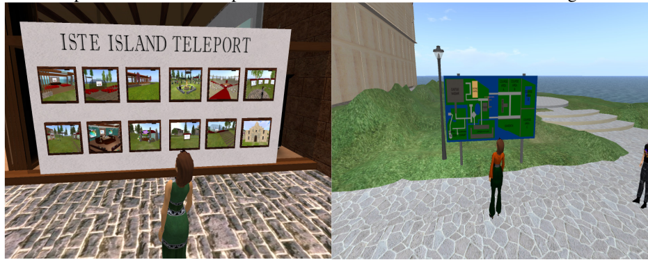
Figure 4: (a) A teleport map; (b) map showing the various places on the island

teleport maps or even maps (see Figure 4) help in orientation and provide robust mental representations of the space and aid the user in route decision-making.