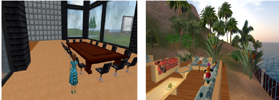
Figure 2. (a) A meeting room; (b) An open-air meeting venue

Consider ambience and aesthetics of the learning space: Ambience and visual aesthetics are important design criteria. Aesthetic designs are perceived as easier to use and promote creative thinking and problem solving (see Figure 2(b)): “If they feel relaxed here -, from visually stimulation, or aural (sound of water flowing)...then maybe they engage more with the tutorial and say more than they would in real-life in lecture hall or for something comparable with MSc usage - they are distance learners and we use discussion boards, skype, wikis, blogs, email...” [SL educator]