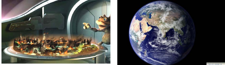
Fig 3. Screenshots from 80Days' game demonstrator.