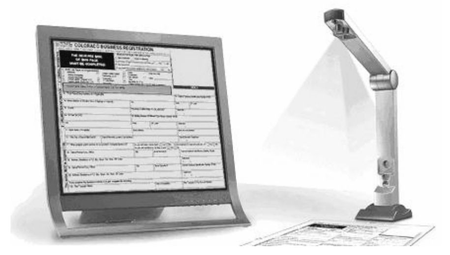
Figure 3. Desktop client with digital camera

Figure 3 shows a high level configuration of a user client system running on a desktop computer. It consists of a camera unit -shown on the right-hand side - that allows to capture printed documents and the display with speakers built-in. The camera unit enables easy document handling and fast document capture and moreover, is able to treat documents of larger size. Alternatively a scanner could be used. Such a user terminal could be placed for example in a major administrative department. In this case the speakers would be headphones due to privacy considerations.