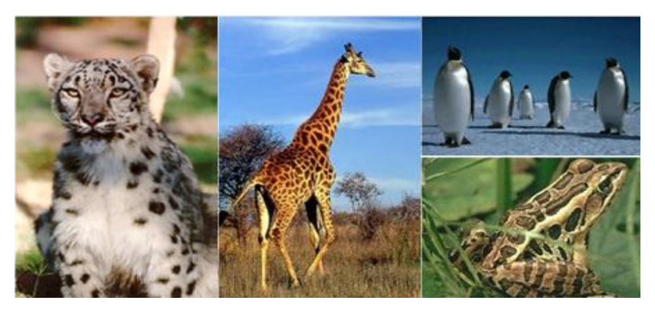
Fig. 3. Example images from Berg dataset

For the sake of comparison, we test the proposed image classification scheme on the ten-animal-class dataset of Berg available from [15]. Fig.3 shows some images of Berg dataset<sup>1</sup>. Each image is represented with 668-dimensional visual features since the image representation adopted in this paper consists of global and local block-based segmentation features reduced by principal component analysis (PCA). SVM-MK is implemented by adapting the source code of Libsvm [16] so as to construct the mixture of polynomial kernel and RBF. To determine the optimal classification parameters C and \lambda , 10-fold cross validation is conducted on the training image dataset and the best parameters are used in testing. Here, the corresponding parameters are predefined as C =1000, c =1, q =1 and the best representative \lambda value is set to 0.05 by trial and error.