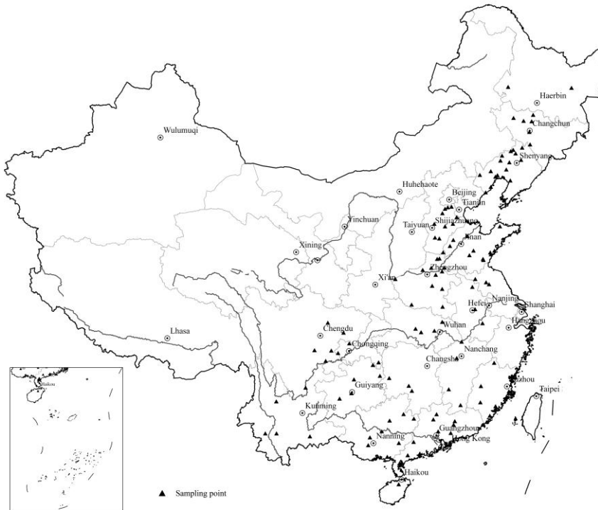
Fig. 1. Sampling points distribution map of 2008

Meteorological factors are provided by China Meteorological Data Sharing Service System, they are log data of 756 stations during peanut growth period. Process meteorological factors in Geostatistical Analyst module of Arcgis9.2 software, use ordinary Kriging method to calculate the spatial interpolation of meteorological factors at 756 points, and then use Extraction command to extract the data.