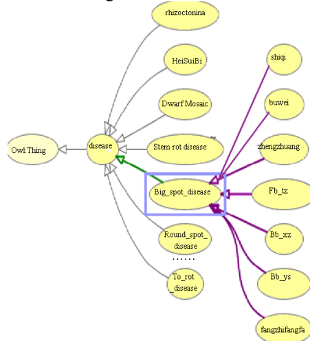
Fig.2. concept structure of ontology maize disease

Ontology constructed as shown in figure 2 below.