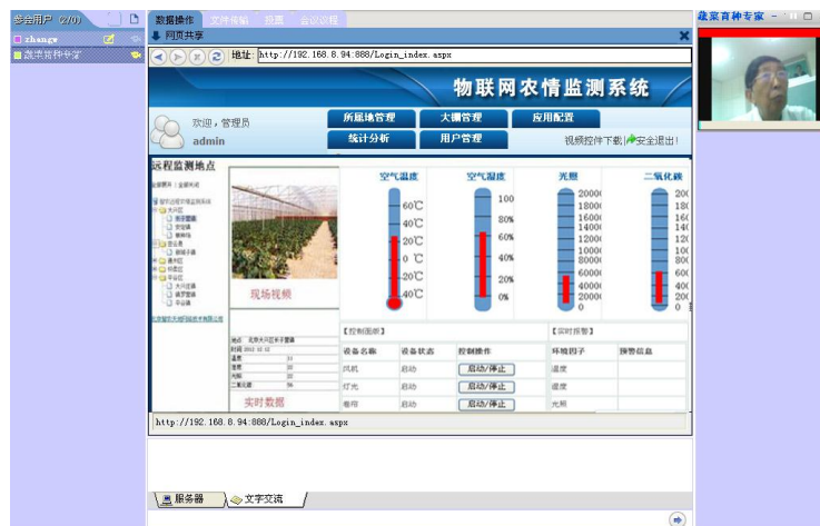
Fig.2 The experimental results