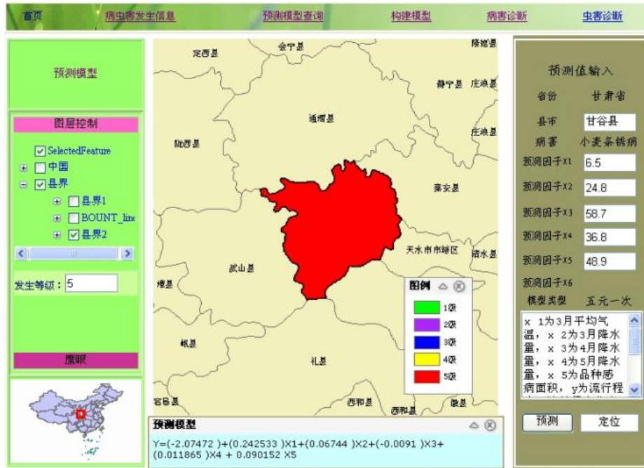
Fig. 5. The prediction results of wheat stripe rust for Gangu County using the web-based prediction system.

system. Then the model could be used to predict the disease prevalence of wheat stripe rust in Gangu County. The prediction result was shown in Fig. 5.