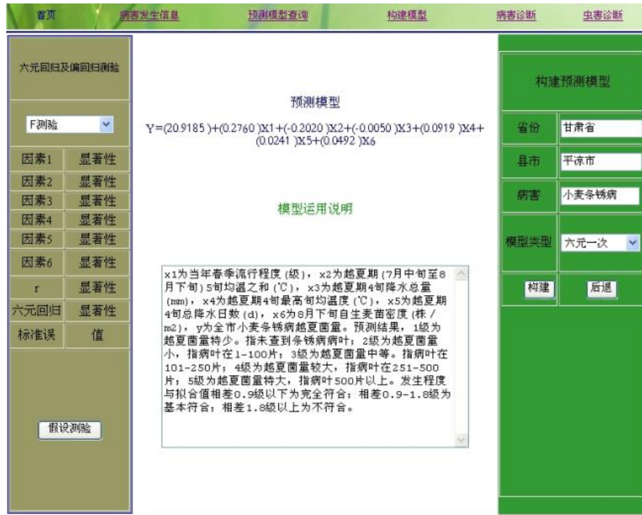
Fig. 4. The prediction model built by using the web-based prediction system for wheat stripe rust.

the network technologies in this system and the results could be displayed in different colors in the web map at the client side according to disease prevalence.