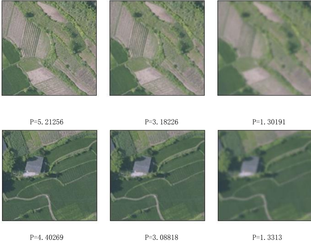
Fig.2. Detection of image definition