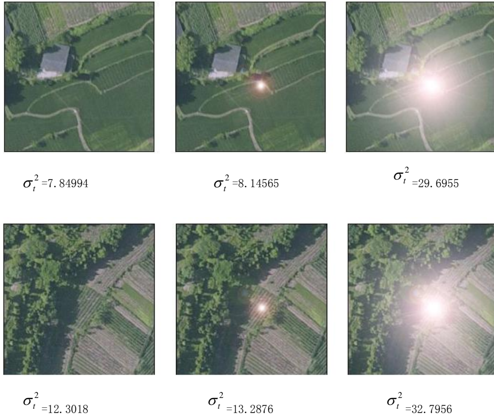
Fig.3. Detection of uniform degree of image brightness