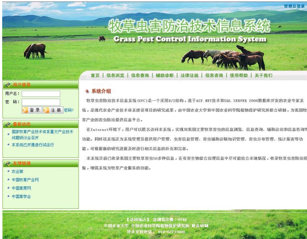
Fig. 2 Index page of GPC