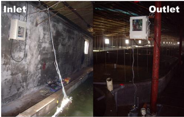
Fig. 2 The water-quality dynamic monitoring systems installed in a practical aquaculture.

Two water-quality dynamic monitoring systems were installed respectively in inlet and outlet of a workshop in Fengzeyuan aquafarm, Dongying Shandong Province, which adopts seawater and semi-circle mode for intensive aquiculture. Wi-Fi module was used in one of the devices, while Wi-Fi module and CDMA module with IPsec-based VPN function were used in another. In this testing, one remote information server with an IPsec-based VPN router is deployed in the China Agricultural University located in Beijing city. The testing experiments were conducted for two years.