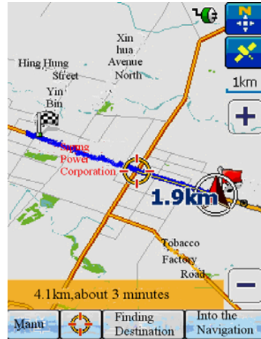
Fig. 2. To start navigation