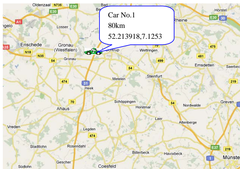
Fig. 4. GPS system monitoring interface sketch