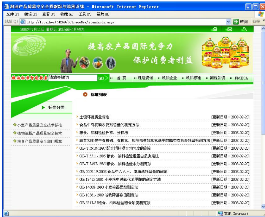
Fig.4 The standards management system in the traceability system

Fig.5 is the expert points function page of FEMCA analysis system. Experts can evaluate the basis of the traceability, the features of every phase, the control measure, and give every indicator a score.