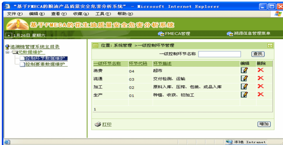
Fig.5 The expert points function of FEMCA analysis system

Fig.5 is the expert points function page of FEMCA analysis system. Experts can evaluate the basis of the traceability, the features of every phase, the control measure, and give every indicator a score.