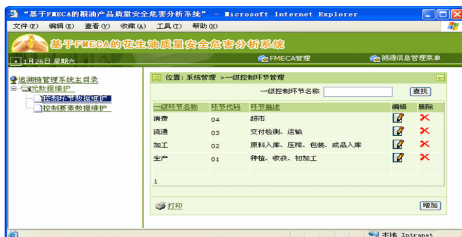
Fig.6 Traceability metadata management sub-system

traceability. These metadata will be used in every phase to describe the features of every product.