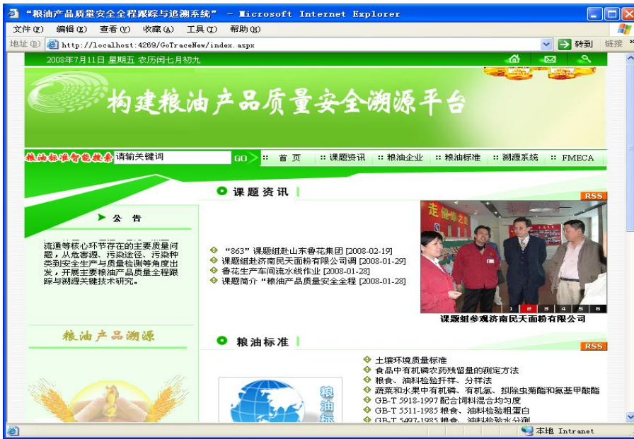
Fig.3 The portal homepage of the system

Fig.3 is the portal of the traceability system. From this homepage, user can visit the related information, and navigate to the subsystem, subscribe related information through RSS, and retrieve the traceability information inside the application.