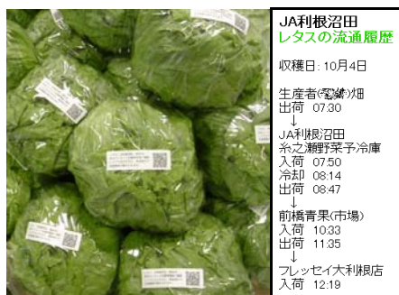
Figure 3. Lettuce products for sale which the “QR code” labels are pasted on (left) and a display of the distribution records on a cell-phone (right).

VIPS and additionally applying “QR code” (Denso Wave Inc.) which is a kind of two-dimensional (2D) barcode system. In Japan, camera-equipped Internet cell-phones have been very popular and most of them have a barcode-reading function. Therefore, the consumers that purchase the products with the QR codes can immediately browse and check the information about the products’ production and distribution, by reading the QR codes using their own cell-phones (Figure 3).