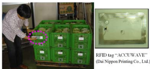
Figure 2. Reading the RFID tags attached to the container cases by using a handy reader in the experiment on lettuce products.

The on-site data-inputting system based on RFID was developed in order to identify the product lots and record the “event” at each point of the distribution process efficiently and quickly. RFID tags which have unique ID to identify individual lots and handy RFID reading devices (readers) compatible with Wi-Fi to read the ID were applied (Figure 2). Additionally, an Internet-accessible database server was built. It can store the data which are sent from the readers and it enables to retrieve and refer the distribution process records on WWW.