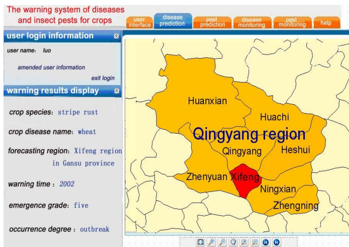
Fig.2. Pre-warning results of wheat stripe rust disease in Xifeng county of Qingyang city in 2002

By the above operation, users could call,, in the model from the database of the system, and got the warning result by calculation. Finally, the pre-warning results were displayed on the right of the main interface by different color by electrical information map, at the same time, the warning results were also display by character form on the left of main interface (Fig.2).