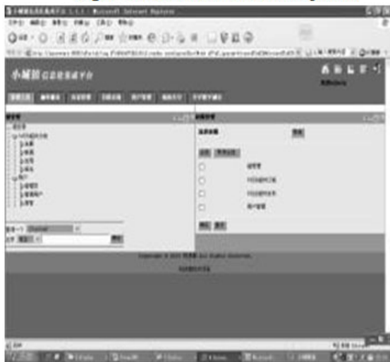
Fig.5. Authority management