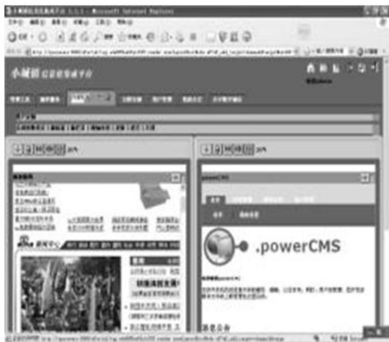
Fig.4. Customization of web component