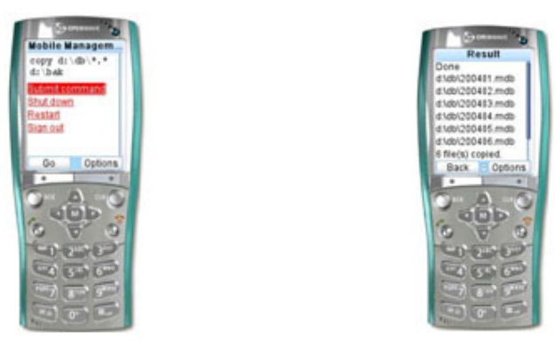
Figure 4. The Interface of the System

Figure 4 shows the interface of the system. Figure 5 shows the showresult form when the command to backup database files has been executed. Figure 6 shows what the server does when the button "Shut down" has been pressed.