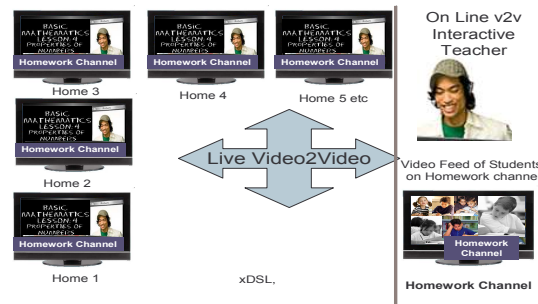
Fig.2. Interactive Homework Channel

provider (as shown in Fig.2). The purpose is to assist and enhance homework activities. An authentication system will be included with the homework channel to support privacy. Extensive technical and usability testing and reporting will be conducted following the implementation of the selected uses cases to schools. The analysis will be based on questionnaires, as well as ad-hoc research activities.