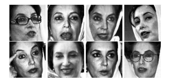
Fig. 4. Examples of one face from the ČTK face corpus

Figure 4 shows one example from this corpus. This corpus is available for free for the research purpose upon request to the authors.