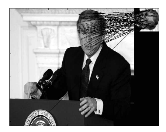
Fig. 2. Matched key-points in two different views of the same object (face)

Figure 2 shows how two images of the same object (a face) with varying scale and orientation are matched.