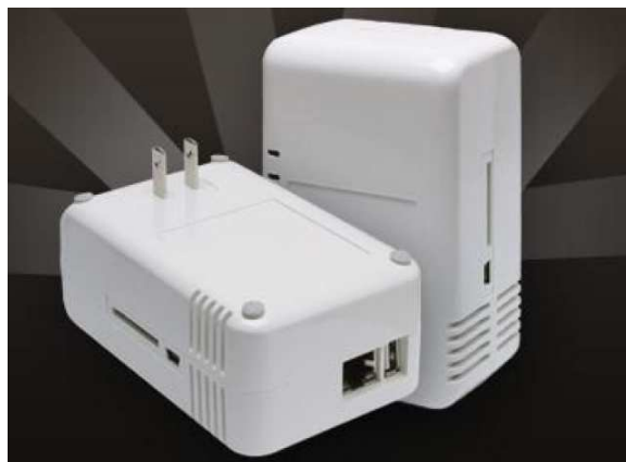
Figure 1. SheevaPlug plug computer.

and laptops, plug computers have the potential to be used in nefarious ways, all the while maintaining a low profile because of their small size.