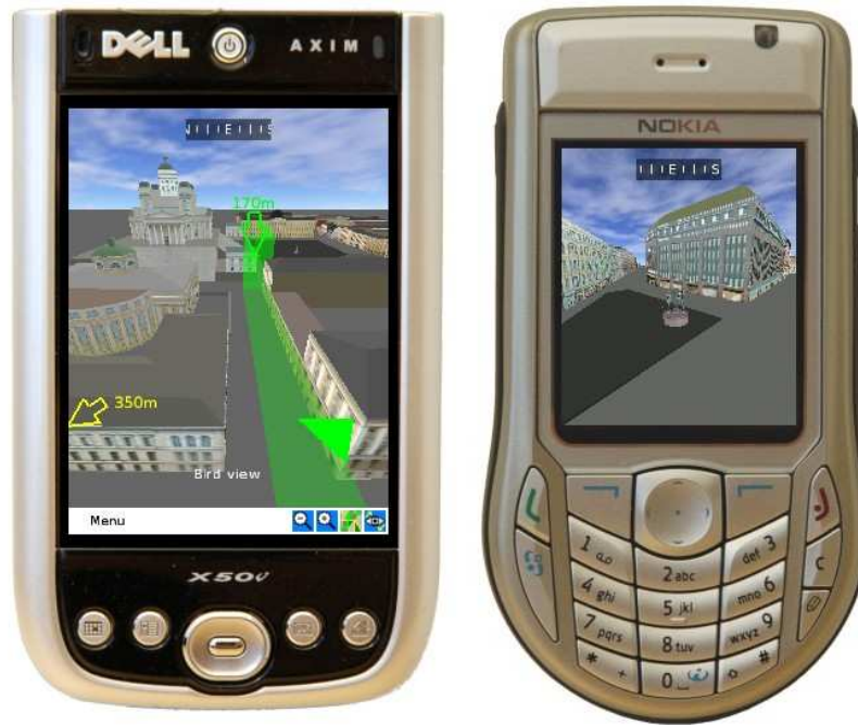
Fig. 1. mLOMA client running on Pocket PC and Symbian Series 60 platforms

mLOMA [13] (mobile LOcation aware Messaging Application) is in its essence a 3D map application optimized for mobile devices and built on top of OpenGL [9] and GLUT [6]. The mLOMA client can be used to browse a real time rendered 3D scene with a framerate acceptable for interactive use. It features a route guidance system and support for GPS location tracking. A server component is also provided. If a network connection is available, clients can receive up-to-date information on the model and interact using the server. Users can track each others' locations and communicate using messages. Messages can be public or targeted to individual users and they can be attached to any points in space or the model.