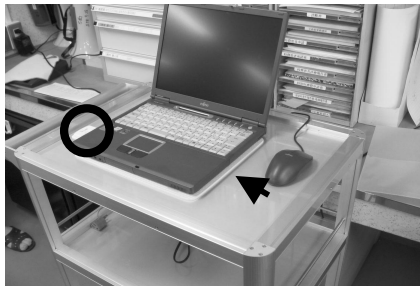
Fig. 3 A wireless LAN terminal at SUH (circle, wireless LAN card; arrow, a vibration-absorbing mat)