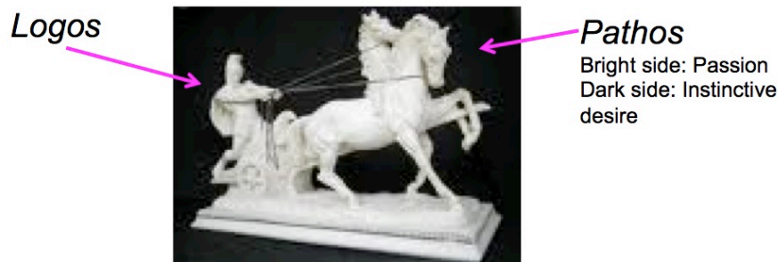
Fig. 2. Logos and pathos.