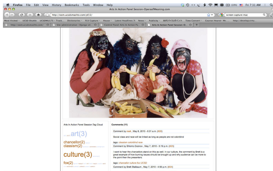
Figure 2. An example screen of OoM for an event regarding Art Activism

An example of the screens and comments generated by OoM are given in Figure 2. This is one of multiple pages that were running during a panel session in the Theater Department in UCSD on activism in the arts. The central image represents a theatrical group called “Guerilla Gilrs”, and it was brought up to demonstrate an example of feminist art activism, embedded from the web after searching for contents related to the topic of the main presentation [art activism, theatre, feminism]. The lower half of the screen shows the audience chat on the right and a dynamic text cloud on the left. Each one of the display elements comprises a separate object in the OoM system.