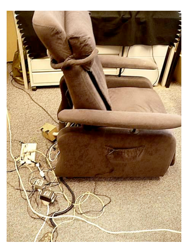
Fig. 1. Two views of the chair prototype that was developed for this experiment. On the left the air ventilation system as well as a vibration feedback implementation can be seen. The picture on the right shows the back cushion into which heating pads are integrated and the electronics that communicate with the hardware.