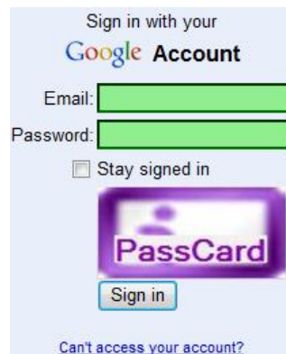
Fig. 3. PassCard logo