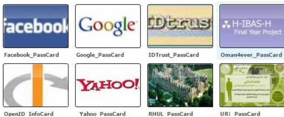
Fig. 2. PassCards

Prior to, or during, use of the CPM, the user invokes the CIdS and creates a PassCard, inserting their username in the firstname field and password in the lastname field. Optionally, the user could also insert the URL of the target website in the web page field 6 (see Sect. 3.2). For ease of identification, the user can give the PassCard a meaningful name, e.g. of the corresponding website. The user can also upload an image for the PassCard, e.g. containing the logo of the intended site. Example PassCards are shown in Fig. 2.