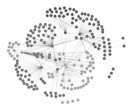
Fig. 2. Scale Free network: Small number of nodes with high degree and a large number of nodes with low degree

Scale free structure: The degree distribution shows a scale free structure that is a heterogeneous network topology encompassing a relatively small number of nodes with exceptionally high degree and a very large number of nodes with low degree (figure 2). One remarkable feature of scale-free networks is that they are highly robust against random errors but on the contrary they are highly vulnerable to attacks targeting nodes which serve as hubs in the network. The scale free modeling lays the emphasis on the network dynamics and its main objective is to model the process that underpins the evolution of complex networks since such an approach will lead to the creation of networks with the correct structure [20, 25].