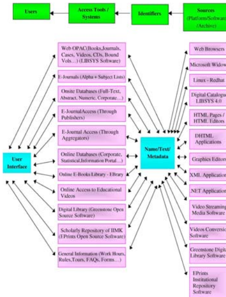
Fig2. Content/information integration model of DL portal

research is required on a larger scale to gather data from every university of LIS and computer science in order to update and extend our findings. We need to develop good models of DL educational programs and courses, and a greater synergy between DL research and education. Finally, we need the resources to develop and sustain an expanding and far reaching program of DL education.