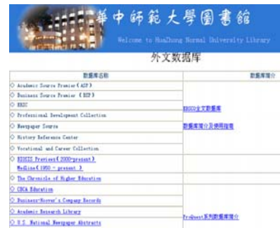
Fig3. Library Portal interface frame of DL HNU