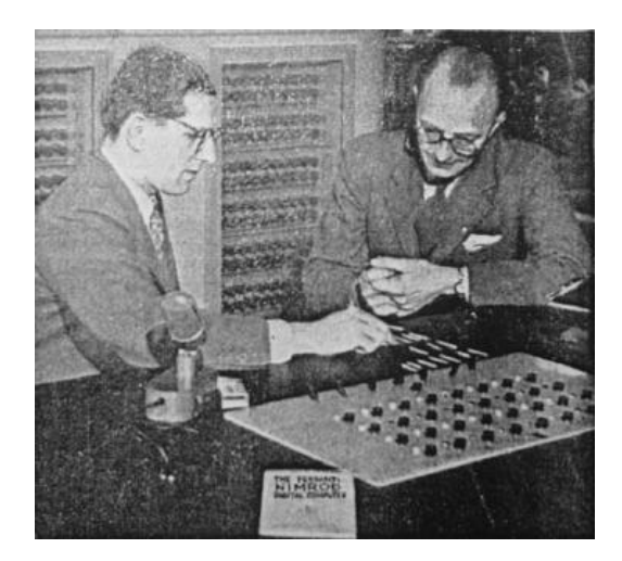
Figure 1: The game board of Nimrod, the Nim-playing computer

Bouton succeeded and provided a simple method that enabled players to analyze the game. By conceiving the heaps as binary numbers and applying a simple adding rule, the player can easily tell whether a position is safe or not. This contrasts the earlier state of affairs, where an experienced player could overview only simple Nim games with relatively few heaps and tokens.