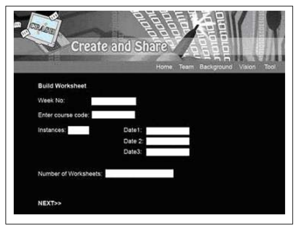
Fig 3. The CRaSh Create Worksheet Page

The CRaSh administrator has the option within the web interface to create new modules, add new staff members, add new students, and also add students to modules. This allows different lecturers to use the application with other modules if they wish and also to share the application with other members of staff who may also be teaching on the same module or who may have seen the application and wish to make use of it within another discipline.