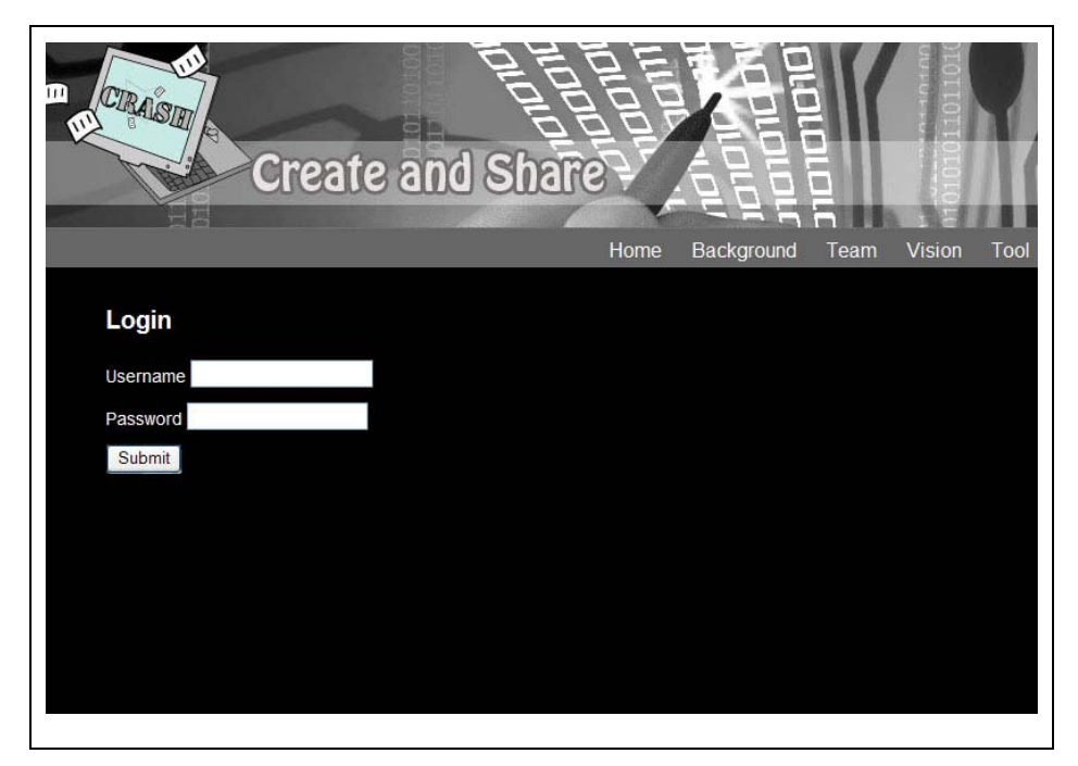
Fig 2. The CRaSh Login Interface

The second interface for CRaSh is the web interface where students log on to see the worksheets that have been created and also to download worksheets for the next class if they have not already received them. This interface involves the use of a Postgress database to store data including student details, course and group details, and uses the server side scripting language PHP in the manipulation of this data. This interface is shown in Fig. 2.