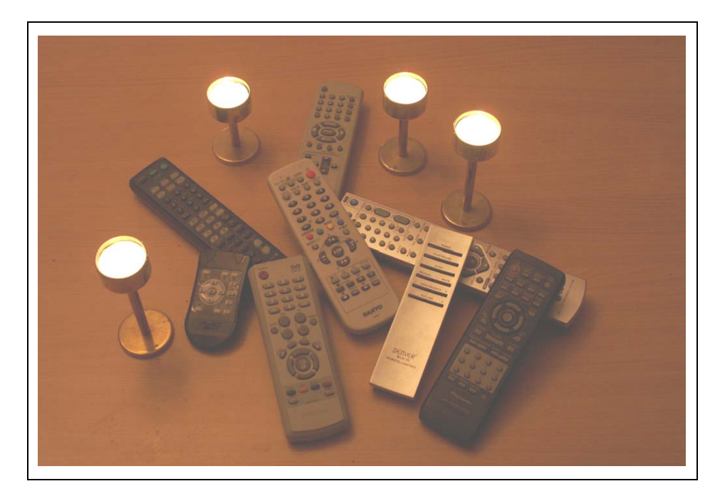
Fig. 1. An example image that is used to illustrate the problem of complex technology in a different way than in an ordinary interface.

Over the years, I have collected many pictures, error dialogues, cartoons and other educational material, which to some extent have been published on the Internet as a free, public resource for teachers, e.g., in Human-Computer Interaction. The material is available on my personal home page [1] and the figures in this article are all displayed on the site. One example of the material that I use is shown in Fig. 1.